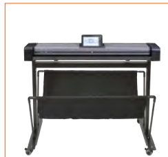
Low stand for side-by-side