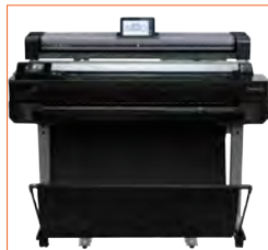
Optional high stand to place over printer.