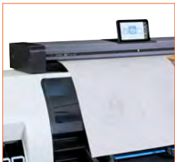
SD One MF is light enough to be placed on any flat surface like a printer.