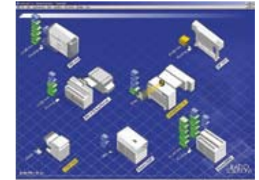
Intuitive Output Control with 3-D GUI it serves the admin with an intuitive view on all plot jobs

CAD Environments, PLM or PDM Systems can be easily adapted either via special drivers or through special settings or interfaces.